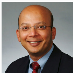
Iftekhar Hasan Editor-in-Chief Journal of Financial Stability

Editors' Panel: What's Hot in Finance? Room: Auditorium A Online access